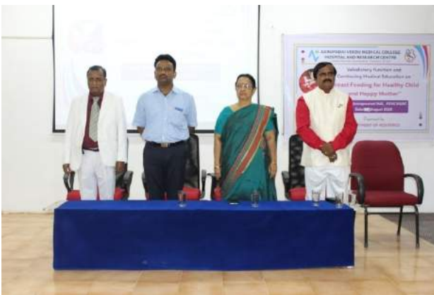
Dignitaries on the Dias