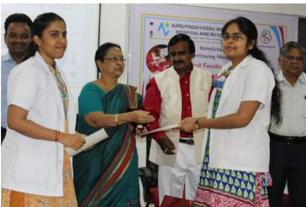
IAP-UG Quiz Prize Distribution