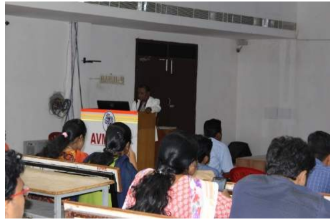
Delivering Vote of Thanks