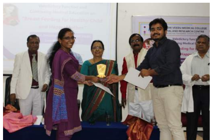
IAP-PG Quiz Prize Distribution