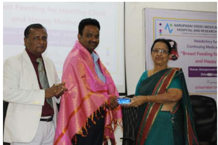
Dean Honoring the Guest Speaker