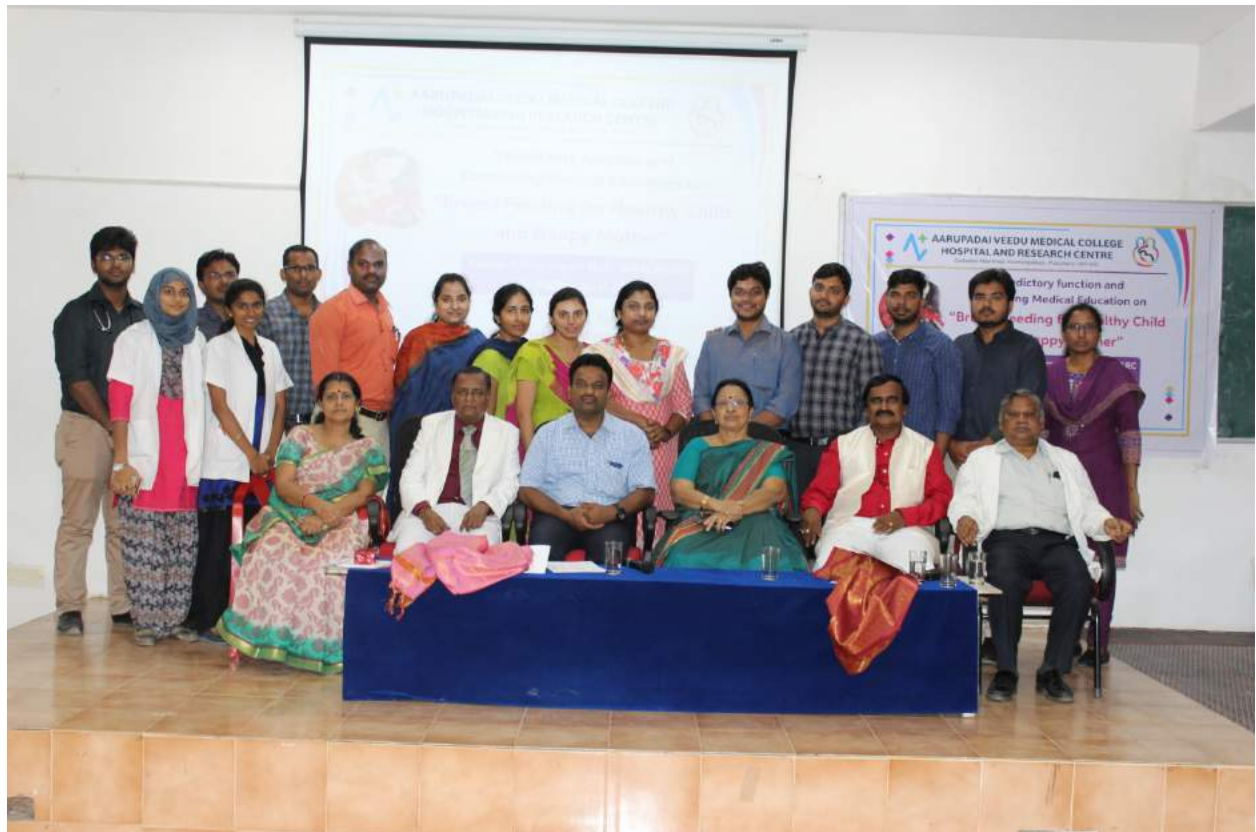
Organizing Team – Department of Paediatrics with the Speakers