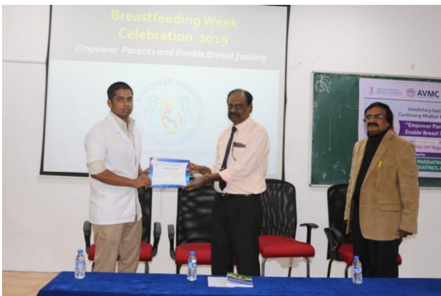
IAP-UG Quiz Prize Distribution