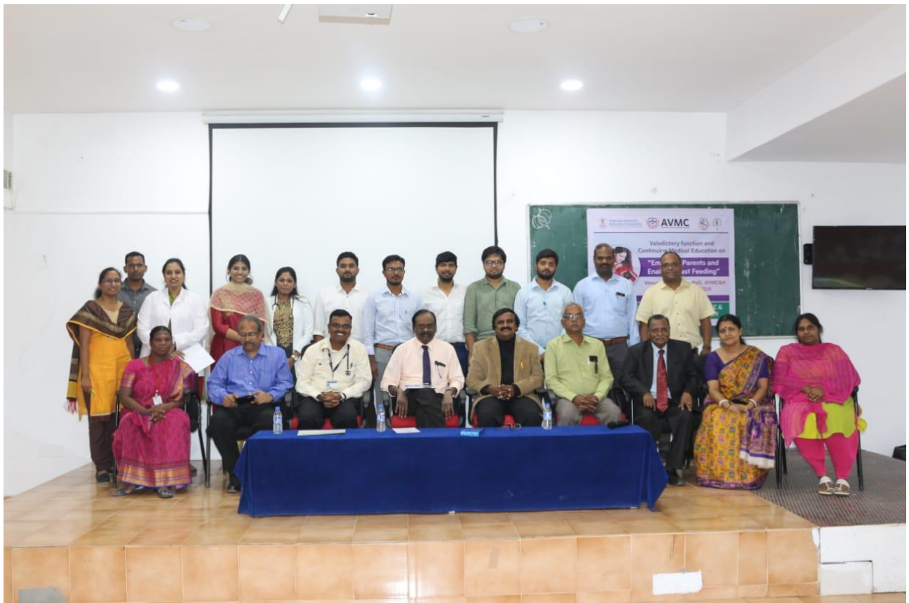
Organizing Team – Department of Paediatrics with the Speakers