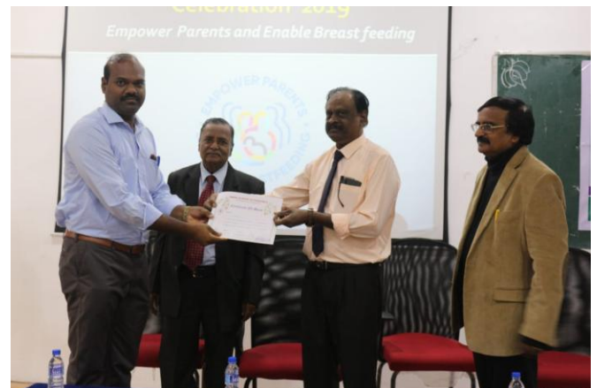
IAP-PG Quiz Prize Distribution