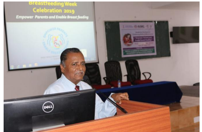
Delivering Vote of Thanks