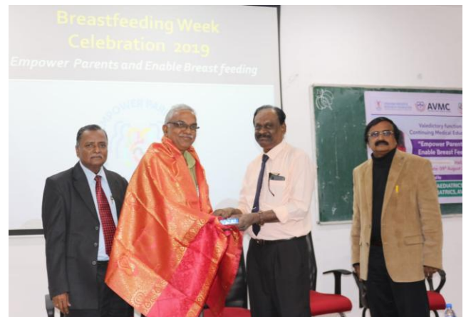
Dean Honoring the Guest Speaker