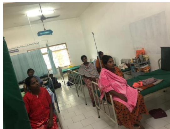
Essential Newborn Care Speech Among Antenatal and Postnatal Mothers