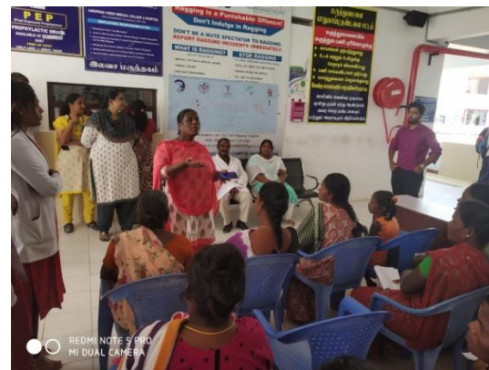
Inaugural Function Photos