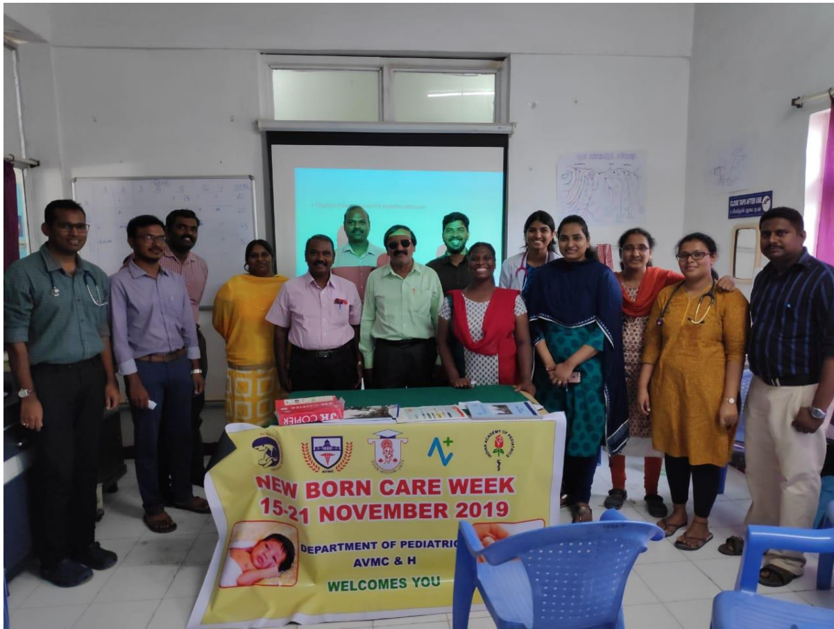
Essential Newborn Care Quiz