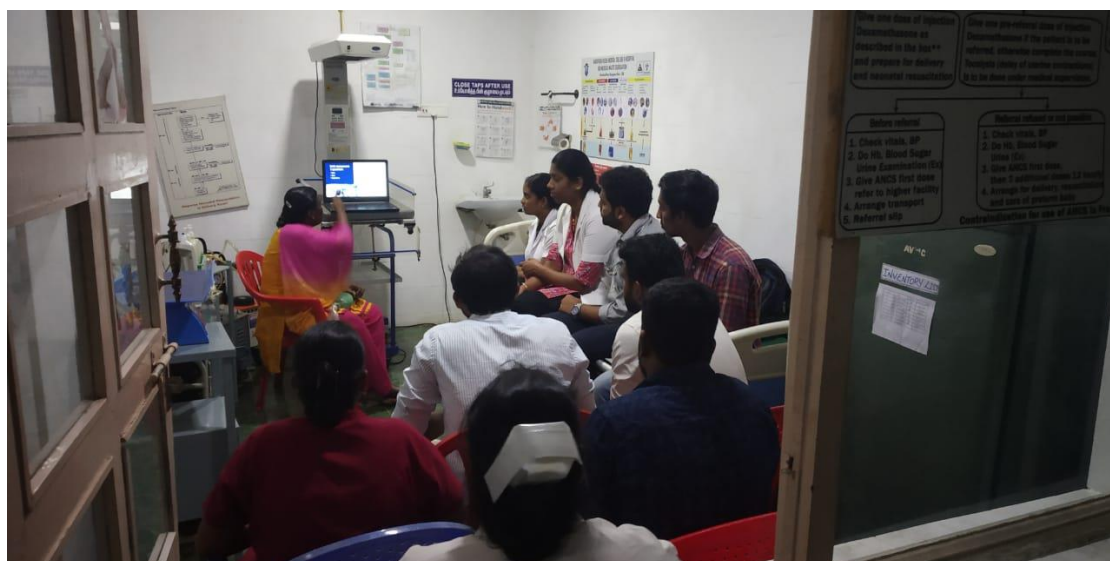
Resuscitative Skills for CRRI and Staff Nurses