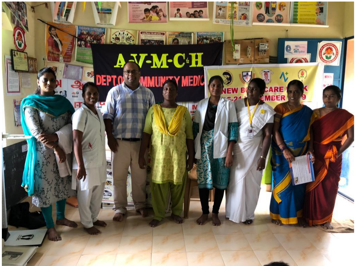
Awareness programme on Essential Newborn care in ICDS Chinna Kanganankuppam Area