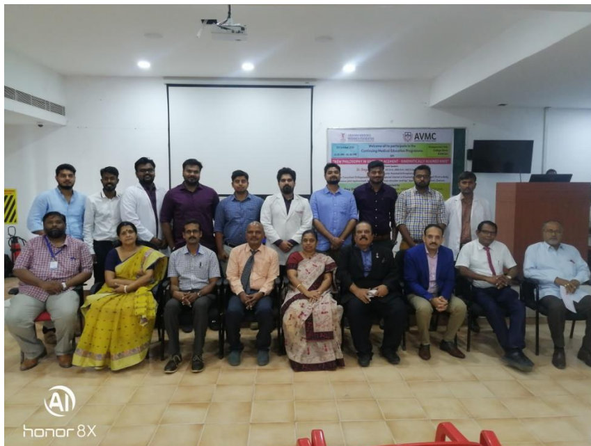
The whole team of Co-ordinators for the CME without whom this Programme would never have been a success.